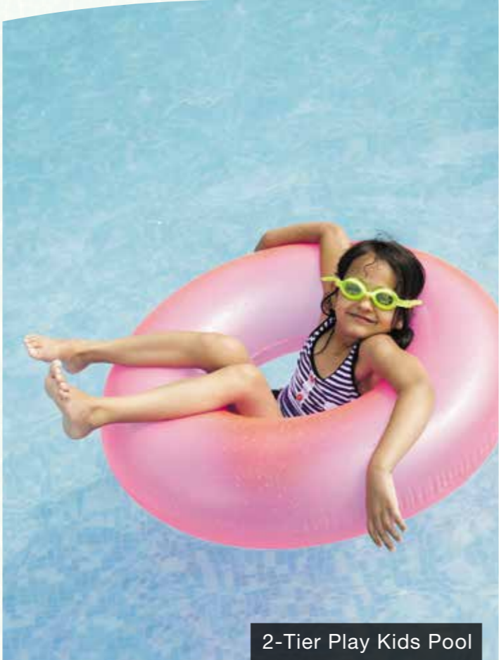
2-Tier Play Kids Pool