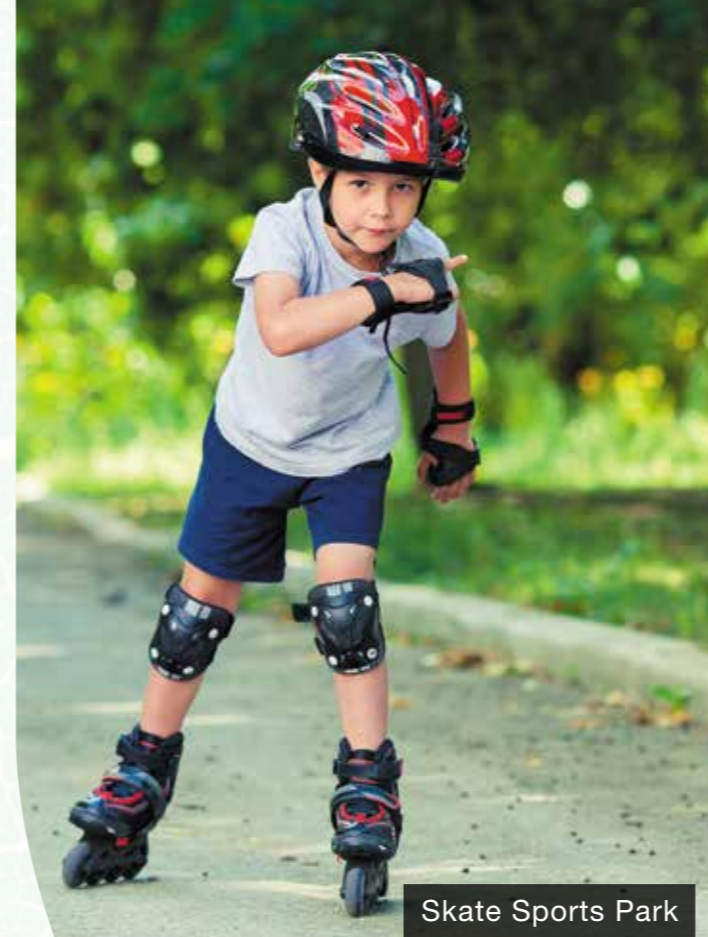
Skate Sports Park