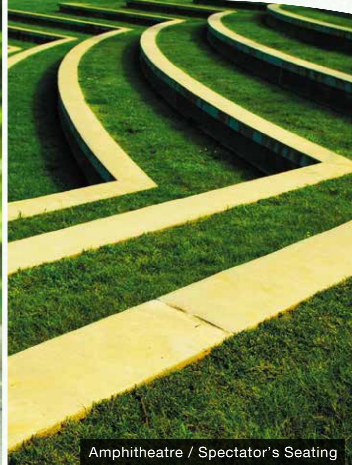
Amphitheatre / Spectator's Seating