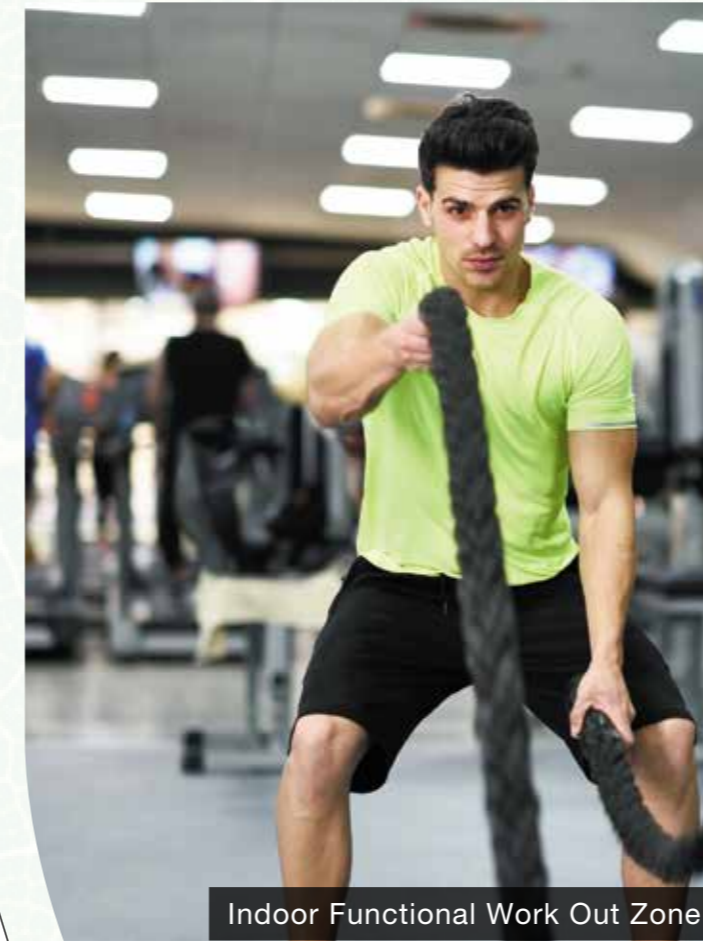
Indoor Functional Work Out Zone