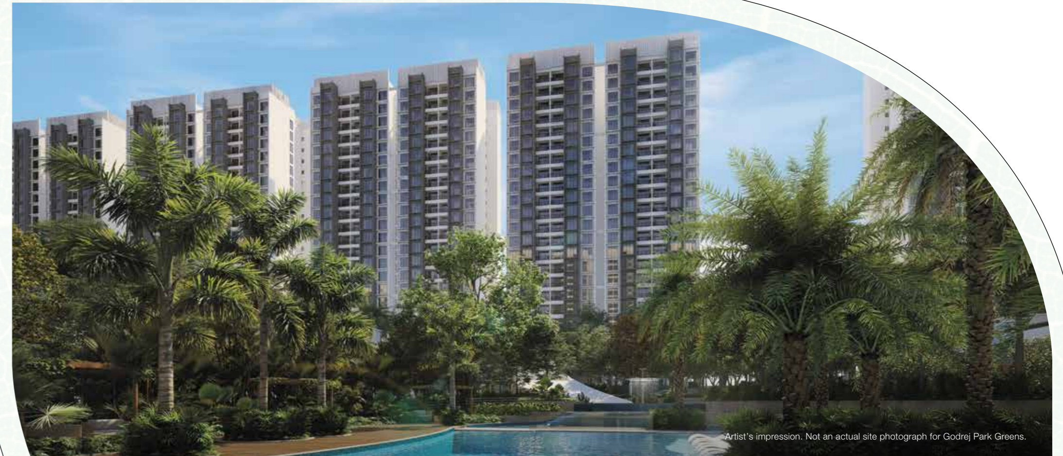
Artist's impression. Not an actual site photograph for Godrej Park Greens.

* https://www.magicbricks.com/advice/invest-smart-pune