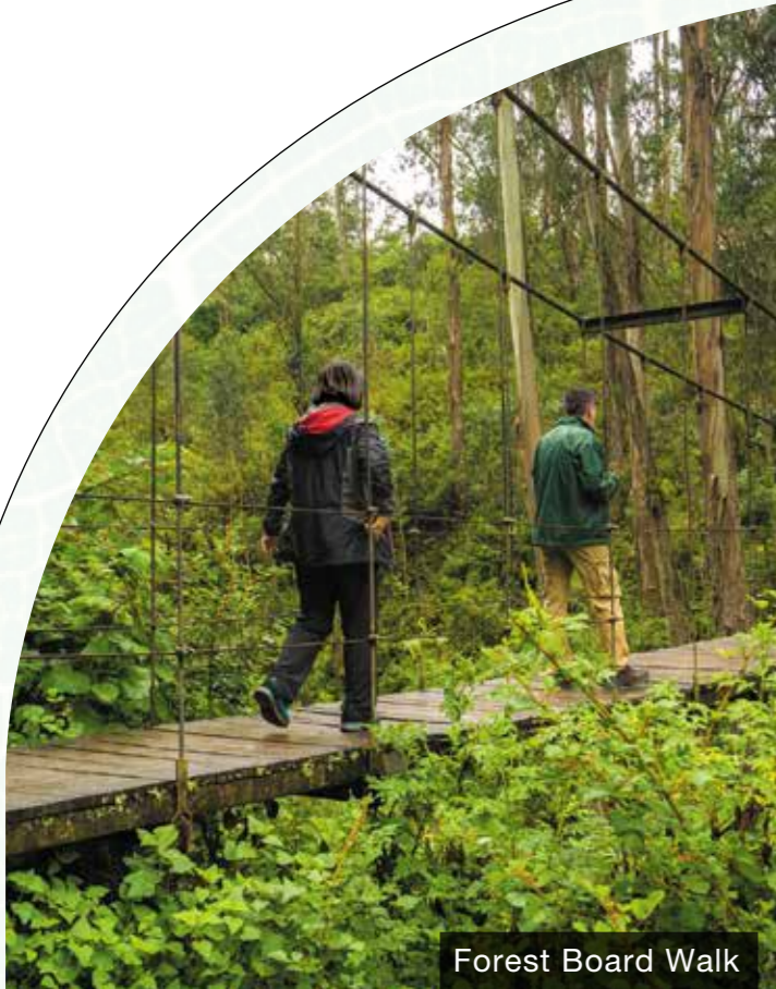
Forest Board Walk